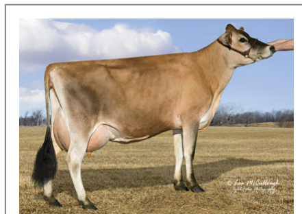
:ucky L Midde