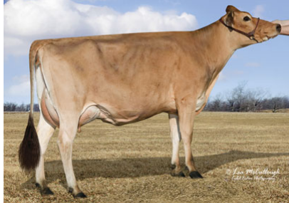
Lucky L Bernie