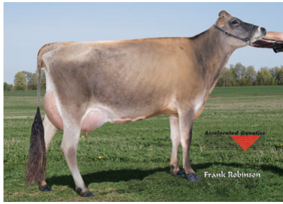
Genesis Grieves 1836