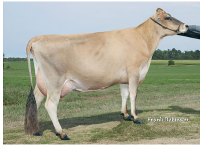
Cascadia Grieves Jerialan