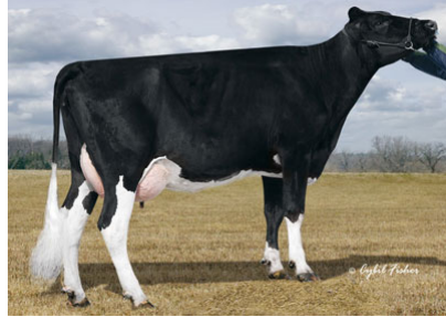
Duban Dotson #227