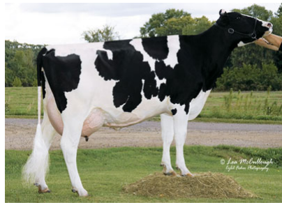
Mc Kaeding Dotson 1100