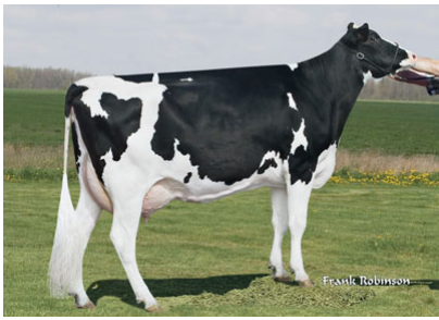
Michigan Dotson Beetle