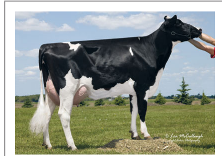
Vellma Farms Paxton Brandi GP-82