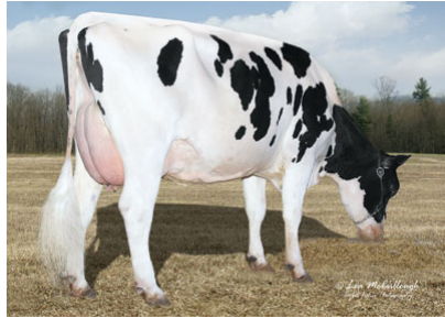
Gold Dust 7230