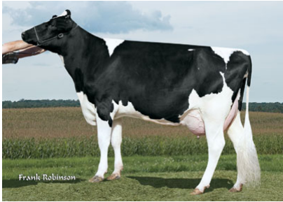
Zuppan Onward 2037