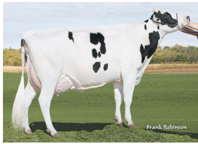
2nd Lactation: DeJong Onward 1599