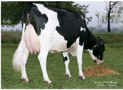
Visionquest Onward 216