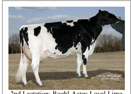
2nd Lactation: Roehl-Acres Loyal Limo VG-85