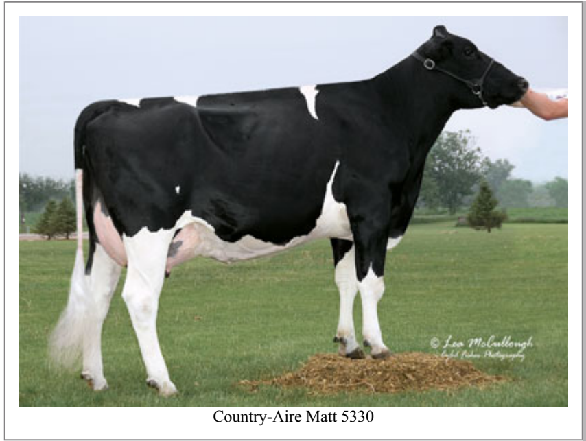
Country-Aire Matt 5330